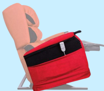
Tilt-in-Space & Legrest