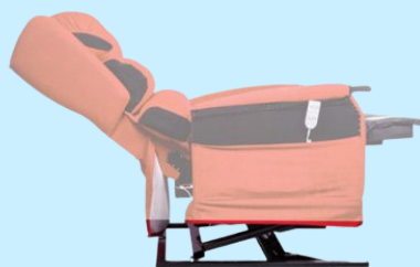
Raised horizontal position for carers