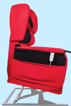
Independent selection of angle Lift-to-Stand